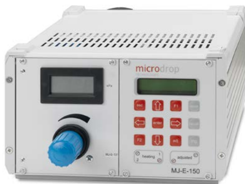
Nanojet driver electronics (NJ-E-4092 and NJ-E-4133) for Nanojet piezovalve NJ-K-4...