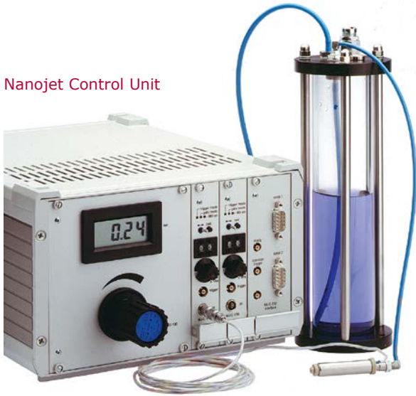
Nanojet Control Unit